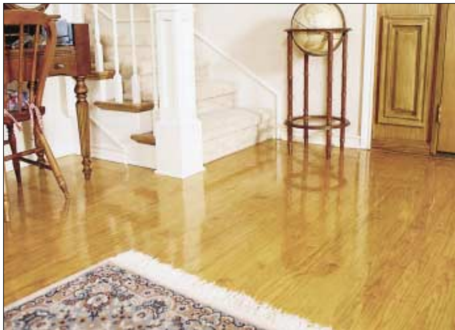
Southern pine floors such as this one are graded according to standards established by the Southern Pine Inspection Bureau.

Some lumber mills, as well as some wood flooring manufacturers, will take a particular grade of lumber — typically 2A or 3A — and run it into a flooring profile, without dividing the flooring into grades. This is typically called "mill run" or "run of the mill." Thus, instead of separating the flooring into grades such as clear, select,