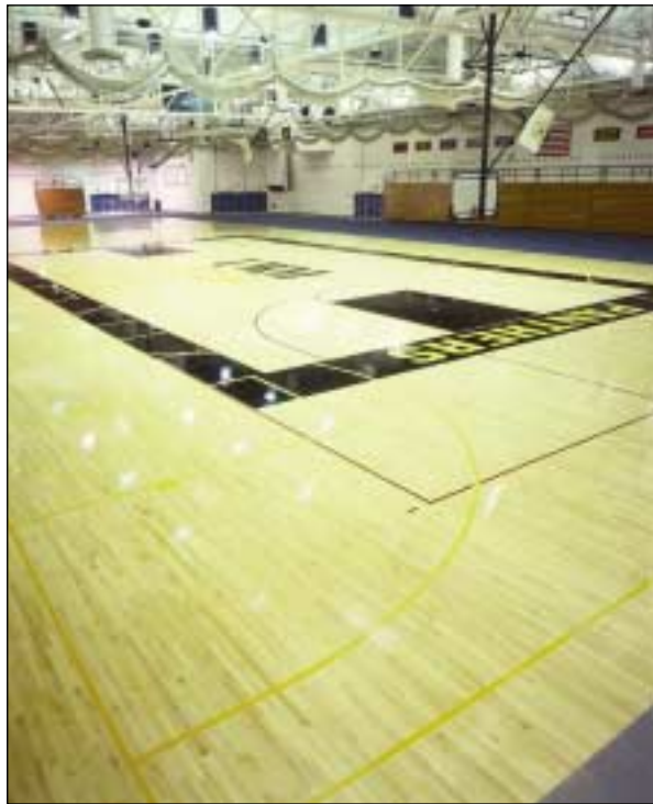
Sports floors are the main focus of the MFMA.