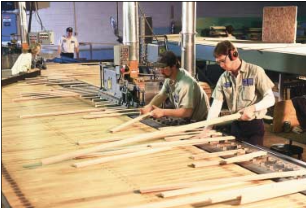
Grades were developed to bring a degree of consistency to wood floors.

Manufacturers must be members of such associations to qualify for their grading dispute service. In other cases, hardwood flooring manufacturers determine their own classifications and create their own grades, or "proprietary grades," by which they sell their flooring.