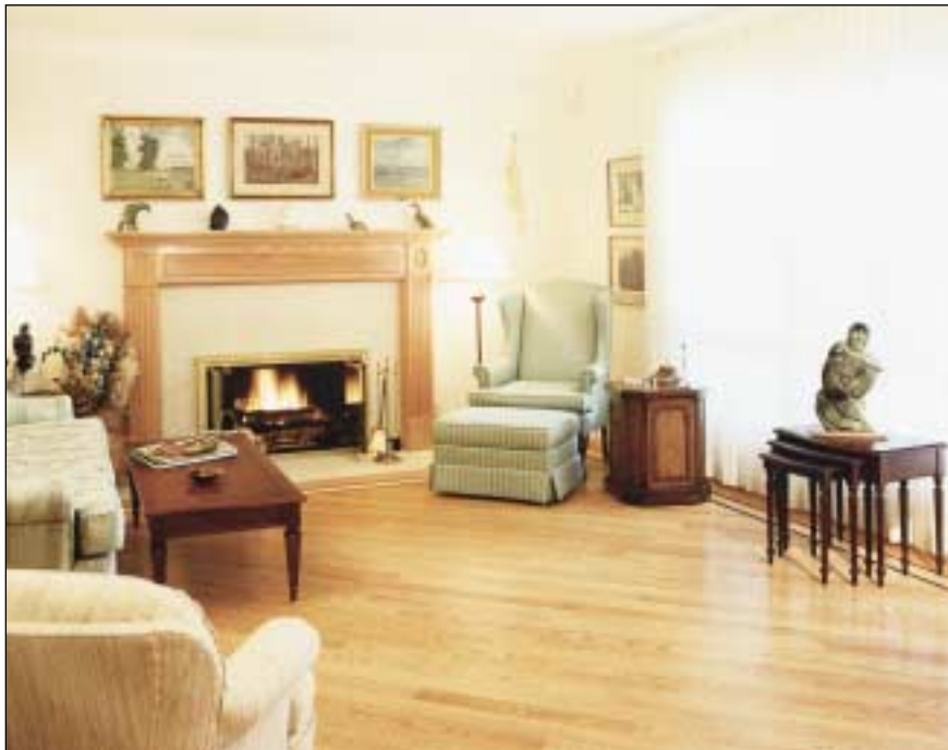
Maple floors are the majority of those manufactured by CLA-member mills.